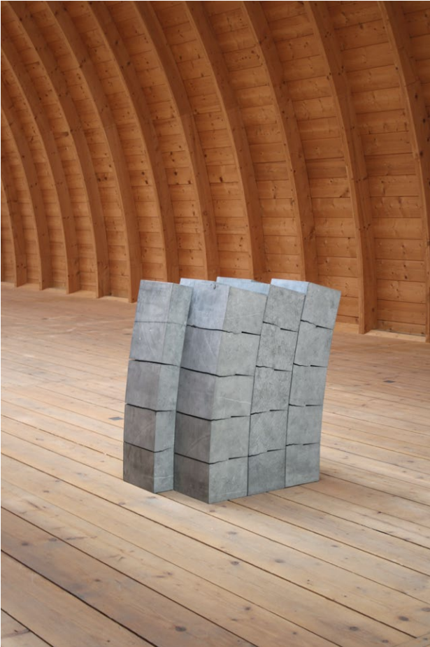
Constellation 30-7, Belgian granite, 105 x 105 x 70 cm, 2006 – 20