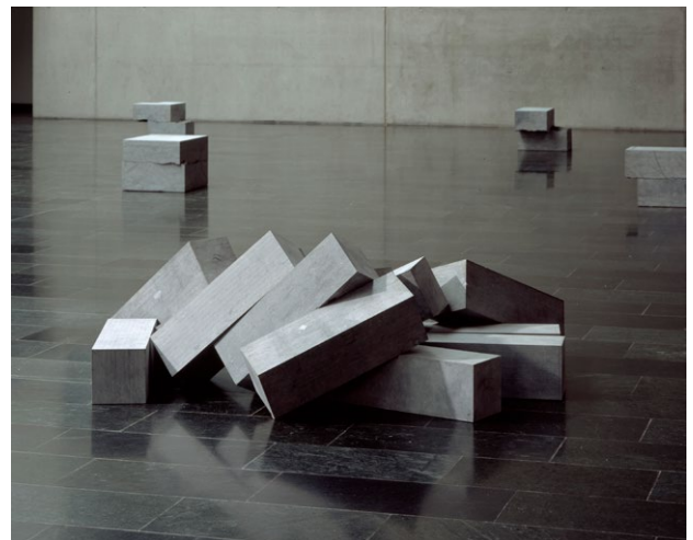
Constellation 12 II, Belgian granite Module size: 68 x 20 x 20 cm, 2006 – 2017