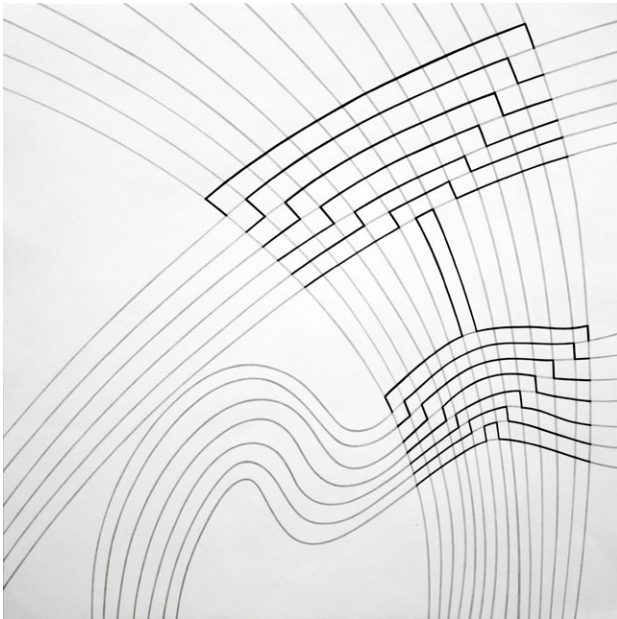
An Image Sequence (Wave), pencil on paper, 40 x 40 cm, 2015