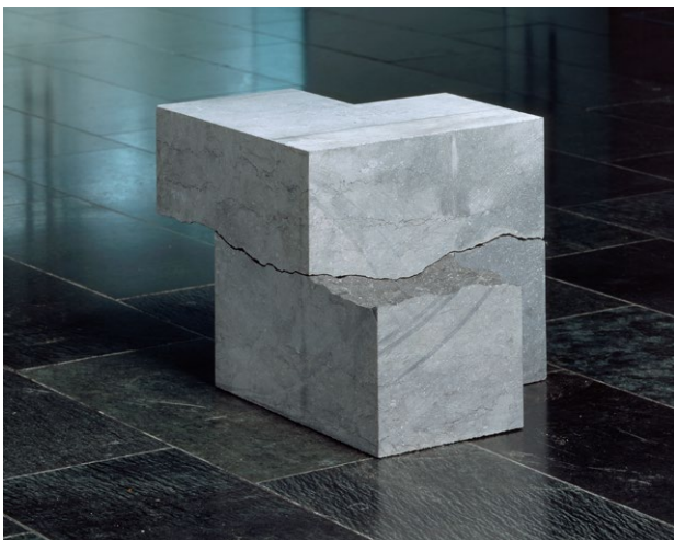
Mental Rotation 12, Belgian granite 52.5 x 38 x 35 cm, 2011

Both Krasimira Stikar and Toni Stegmayer work with a complex interplay of movements, statics, time, and space.